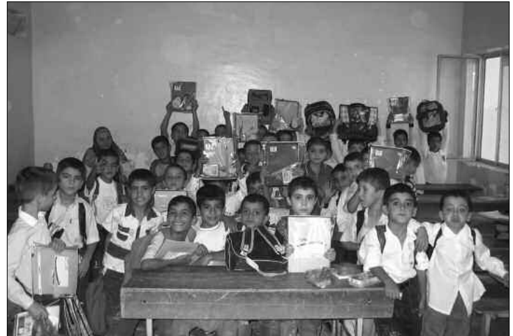
Iraqi children with the clothes and school supplies we sent them