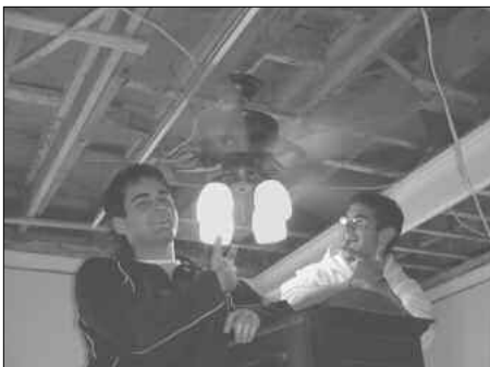
They might not look it, but these guys actually, y'know, fixed things

The House Managers decided to lighten the feel of the room by painting the walls a bright color instead of the previous dull off-white shade. Ultimately, they chose "pale daffodil", a more inviting yellow color, for the walls, and a complementary cream color called "sun glint" for the ceiling. Before installing the brand new and ultra-light fiberglass ceiling panels, they individually painted each one to fit the room's new motif.