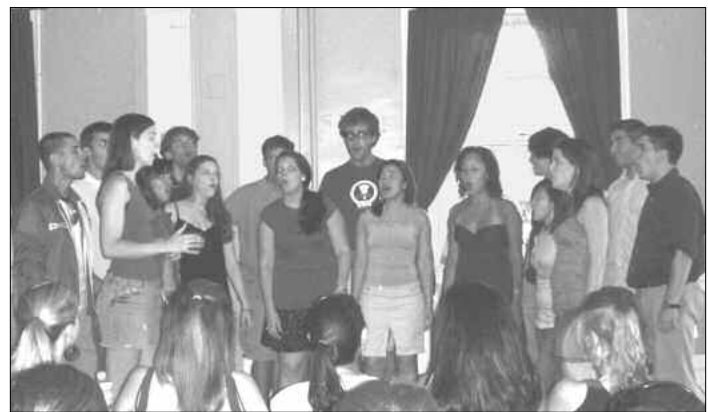
The Dodecaphonic acapella group draws a large crowd to our living room.

Have you paid your dues for July 2006 - June 2007?? Tri-Kap has instituted a new alumni dues billing process, so if you have paid your dues, you won't be receiving a second request for payment.