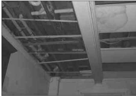
We might be missing a panel or two!

ceiling panels were missing in places and crumbling in others, and the poor fluorescent lighting left the room feeling dark and uninviting. Even the wooden floor was in poor condition—warped and dirty from decades of abuse, it was literally beyond repair.