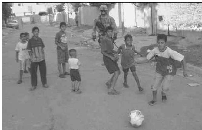
Iraqi children play with a ball we sent over while U.S. Soldier watches