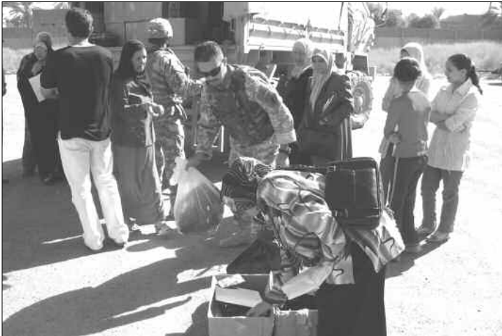
U.S. Soldiers help unload the boxes we sent over