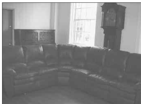
It's amazing what three weeks of hard work can do

The effort was completed with the purchase of dark-brown leather couches with seating for eleven, intelligently positioned around the big-screen television to maximize viewing capacity.