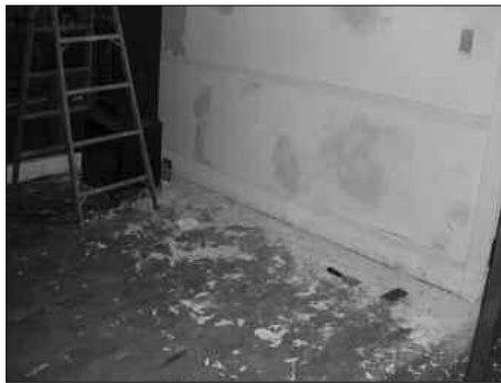
Needs a little work...

Over the past two years we took several steps towards renewing the room. We installed locking, enclosed bookcases to protect our ancient books. We added additional cabinet space to house our house artifacts in the TriKap display cases. And, this summer, interim House Manager Marc "Stevey" Lajoie '08 led an effort that finally fixed the leakage problem by replacing the broken pipes and re-grouting the bathroom floors. But the simple fact remained: our Library, once beautiful, was still in terrible shape.