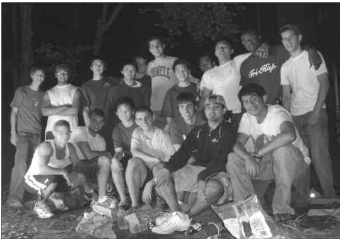
Brothers after a heated debate on the future of the house during the '06 summer lock-in.