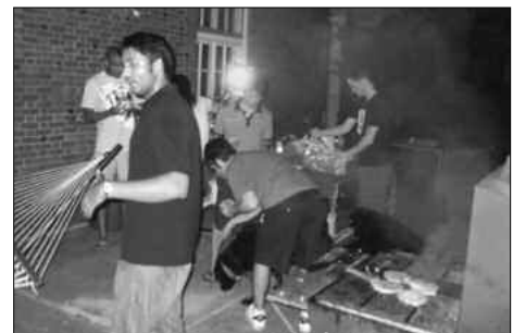
Members of the '08 class try to pack in just a few more calories after a weekend of partying during our weekly Sunday night cookout.